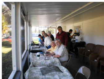
For More Pictures.....